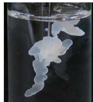
In situ forming implant consisting of sucrose ester dissolved in NMP, injected in phosphate buffer [3]

Injectable gels. More recently, depot formulations in the form of injectable gels have been developed. These gels, which may be understood as semisolid implants, are either injected as such or in the form of a viscous liquid which solidifies after injection at the site of administration (" in-situ gelling systems"). The solidification may be caused by an incorporated polymer which is desolvated either by the migration of a biocompatible solvent or through the thermal, ionic, or pH-conditions in the tissue. Ideally, the gels are as convenient as simple aqueous solutions, easily and painlessly injectable with a small needle, while providing nearly the same release control as solid implants. In practice, their performance is more comparable to that of microparticles, perhaps with slight advantages in terms of injectability, but with a pronounced