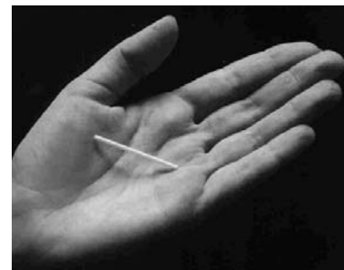
Implanon ® stick with a drug release profile over 3 years [1]

Polymeric implants. The incorporation of a drug substance in a polymeric matrix allows substantial control over the release profile, using diffusion and (if the polymer is biodegradable) polymer erosion as release mechanisms. Implants have proved versatile and suitable for the delivery of a variety of active compounds including peptide drugs (e.g. Zoladex ® , Profact ® Depot). Depending on the choice of the polymer, drug release times of up to several years can be achieved (e.g. Norplant ® , Implanon ® ). However, such long durations usually require the use of non-degradable polymers such as polydimethylsiloxane or poly(ethylene-co-vinyl acetate), which necessitates the microsurgical removal of the implant after the designated period of use. In contrast, biodegradable polymers such as poly(lactide-co-glycolide) and poly( \epsilon -caprolactone) are fully absorbed and do not need to be removed. The subcutaneous insertion of implants, which are often cylindrically shaped, requires needles with relatively large diameters, and sometimes even minor incisions (e.g. for Norplant ® ), in which case a pain-free procedure is ensured by the pre-administration of a local anesthetic. Drug delivery companies offering know-how in the development of implants include Durect (Durin ® technology), Debio (Mimplant ® technology), and Valera (Hydron technology).